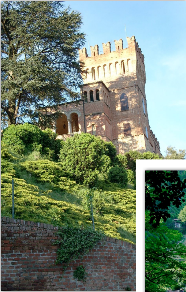
Mornico Losana castle