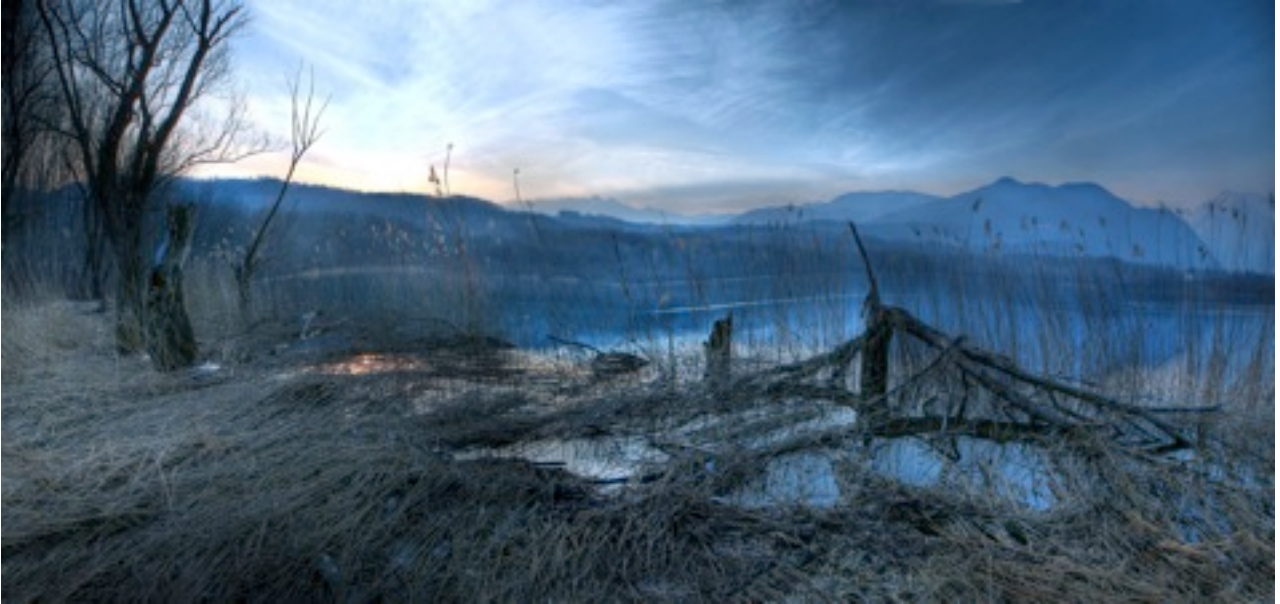
Avigliana, Lago Piccolo