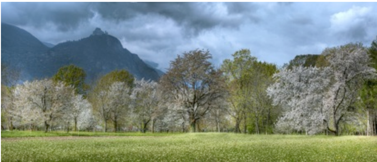
Almese 2”

The course aims to provide a “Way of seeing”. Will discuss the technical and theoretical aspects that are encountered in this kind of photography. The rules of composition, the optics to be used, the use of digital camera in it's essential aspects. But above all, try to understand what characterizes any atmosphere, how can we take with us the feeling. What makes our unique look at the time. Particular attention will be paid to the post-production phase and in particular to the HDR technique that allows to obtain the photographs with a very similar impact to painting techniques. Special attention will be devoted to photography of the forest. A subject as fascinating as it is difficult to grasp the essence. To photograph is often becoming part of what we photograph. Being before seeing. There will be two excursions (early morning and during the late afternoon) to take pictures.